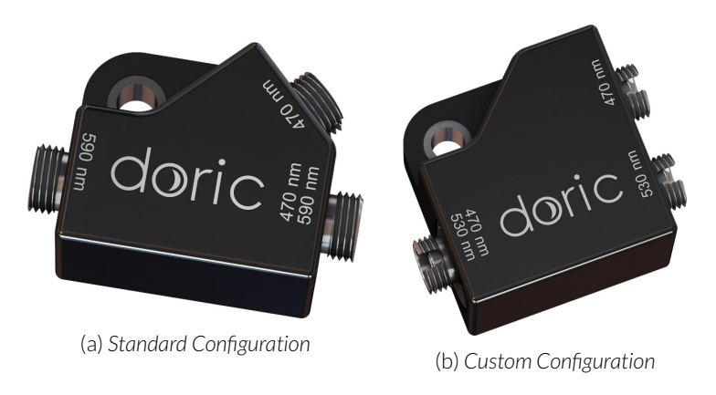
Figure 1.2: Doric Mini Cubes, Wavelength Division

The most popular configuration (shown in Fig. 1.2a) splits/combines light at 470 nm and 590 nm wavelengths. Custom wavelength requests are possible.