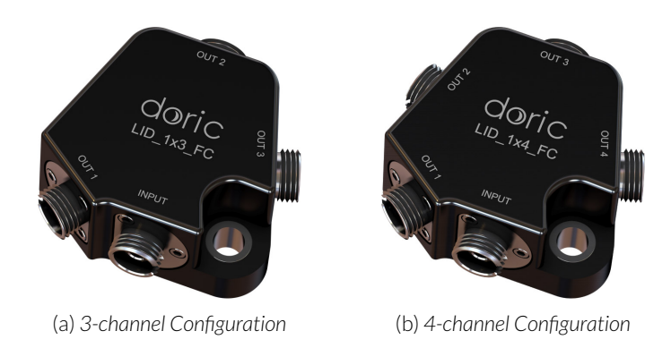
Figure 1.4: Light Intensity Distributors

The Light Intensity Distributor is a small form factor intensity splitter with 3 (Fig. 1.4a) or 4 (Fig. 1.4b) equal-intensity output channels with low polarization dependant loss. This is due to the low angle of incidence allowed by the pentagonal geometry. The distributor is designed for use with multimode fibers only.