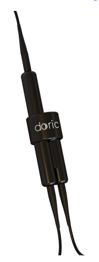
Figure 1.3: Doric Micro Splitters

The Doric Micro Splitters ( DMS ) is a reduced form-factor pigtailed splitter to avoid the need for a connector receptacle. Custom fiber-optic types can be chosen from the list shown in the Catalog.