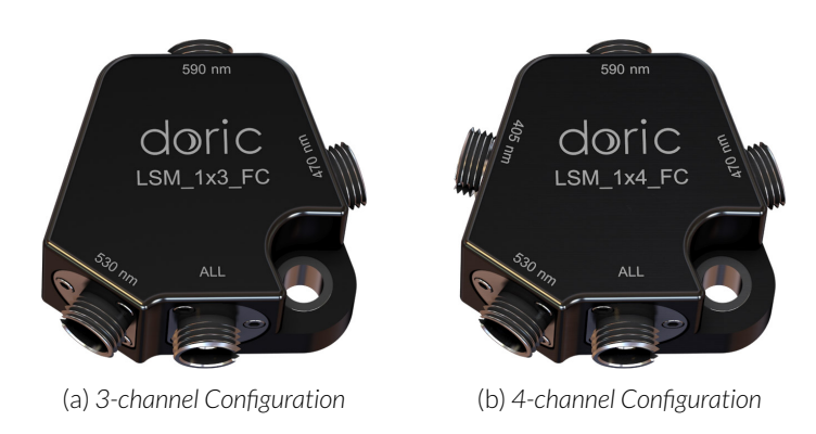
Figure 1.5: Light Spectrum Mixers

The Light Spectrum Mixers allow the combination of multiple signals with different wavelengths. The mixers can be used in the opposite direction as a wavelength splitter for wideband light sources. They come in 3 (Fig. 1.5a) and 4-channel (Fig. 1.5b) models.