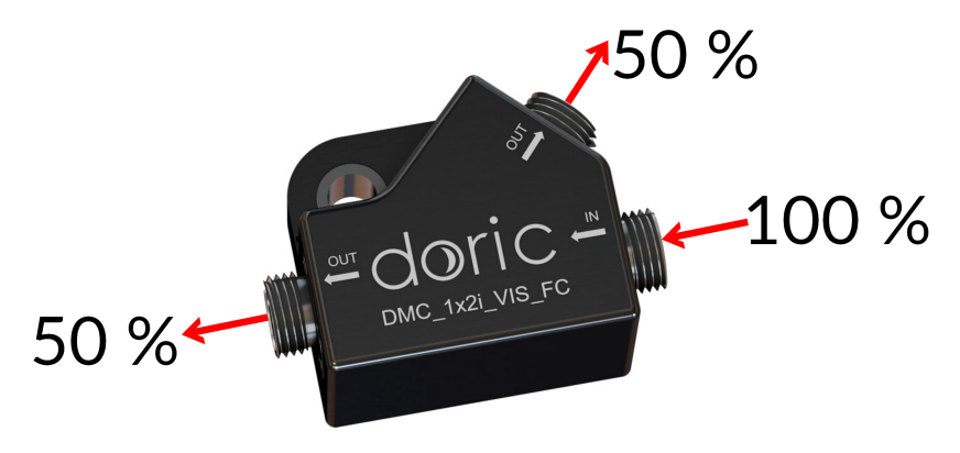
Figure 1.1: Doric Mini Cubes, Intensity Division

The Doric Mini Cube contains an optical system that separates a beam into two output beams. The Intensity Division model (Fig. 1.1) splits the input beam into two output beams of equal power. The standard product is designed for use in the visible spectrum (400-700 nm wavelength). The cube can only be effectively used as a splitter; used as a combiner it will cause significant loss of beam intensity. The standard model uses an FC connector receptacle.