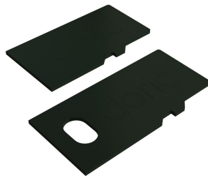
(a) Key Switch